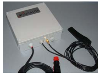
Mobile box to be connected to the cigarette lighter